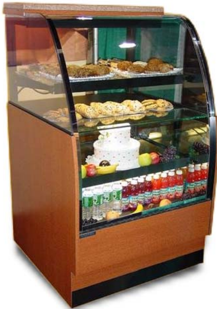
Bakery high combination dry over refrigerated case, model GLEGVS/VD