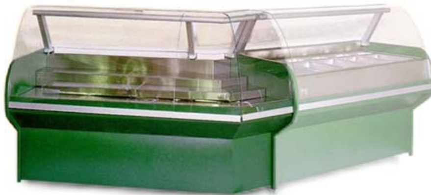
Low profile deli case incorporating 45° outside corner Model IC-LLLG-45