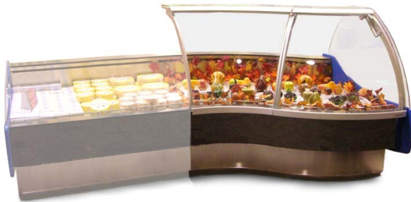
Deli Eclipse refrigerated serving counter corner units

Employees will appreciate the Eclipse, too, for its easy access for serving, restocking or cleaning.