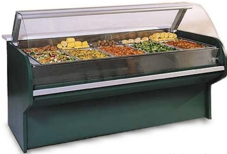
Low profile deli hot food service case Model LLLGHD