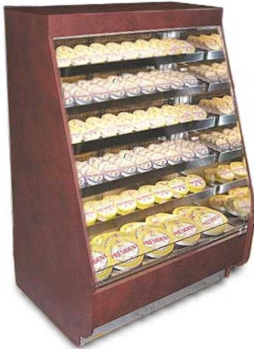
Deli multi-deck self-service case Model SPRED-6