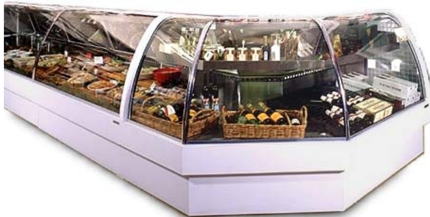
Deli meat case Model TLEGD incorporating 90° corner case