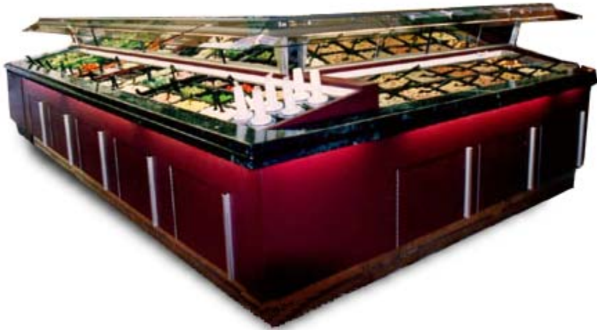
Custom single-sided salad bar Model GPRED.