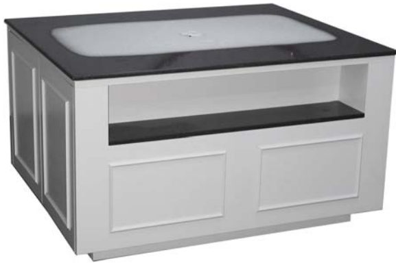
IceRock™ self-service counter with granite top and bottom storage.