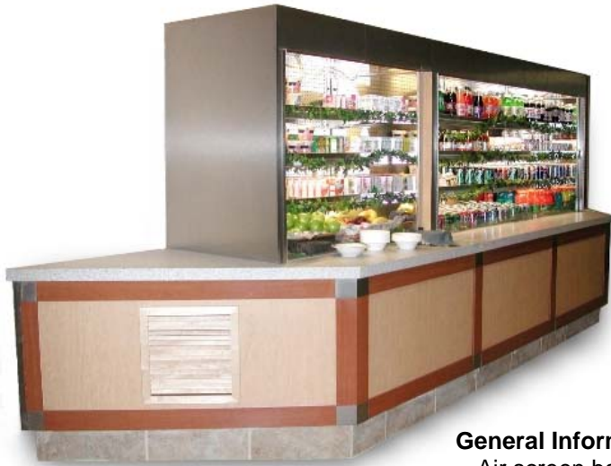
Backwall airscreen case Model SWINA with custom base and countertop.