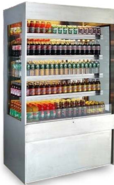
Upright airscreen case Model SWIND with optional glass ends and additional shelf.