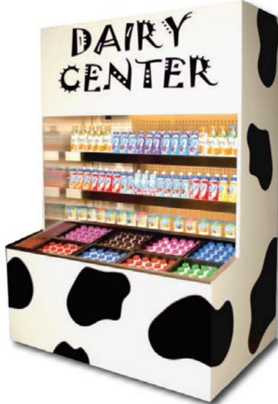
Milkindizer™ airtscreen refrigerated case high girl Model SWINM-HG with custom graphic treatment.