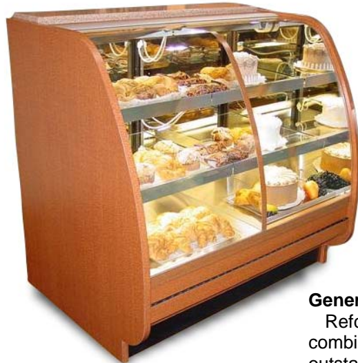
Bakery lift-up glass combination side-by-side refrigerated/dry case Model LLEGBD/BS