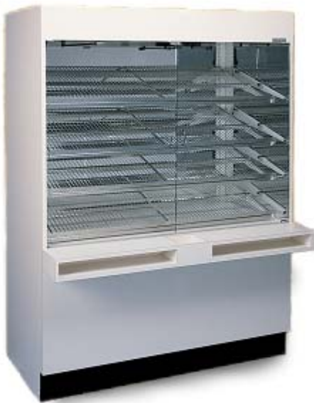
Bakery pastry wall case Model SWINBD