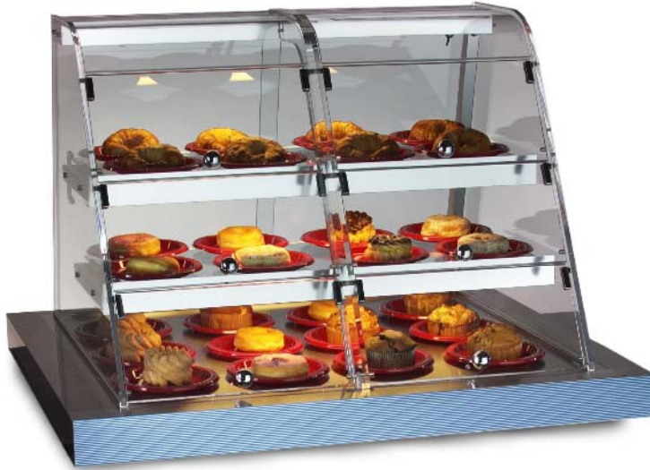
Cafeteria self-service dry case, Model M/SMASDD.