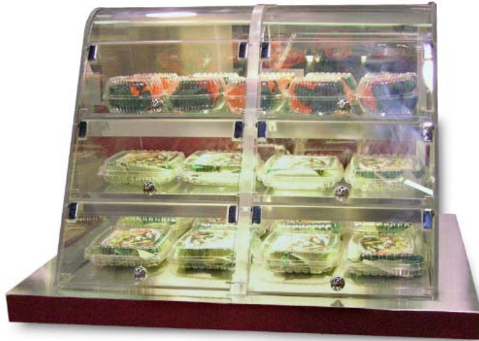
Cafeteria self-service refrigerated case, Model M/SMASDS