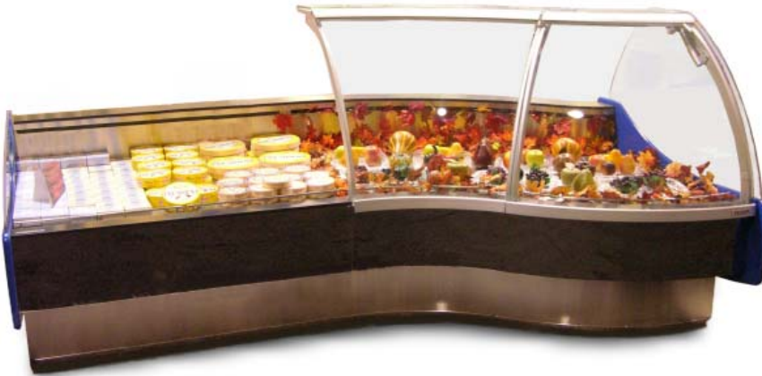
Deli Eclipse refrigerated serving counter